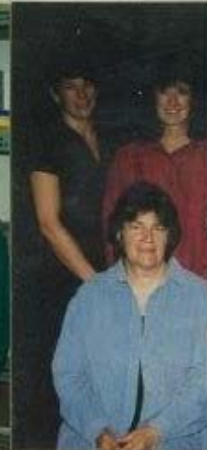
Back Row (L-R): Unit Front Row (L-R):